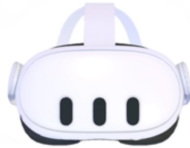
Meta Quest 3