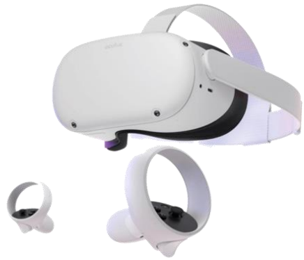
Meta Quest 2